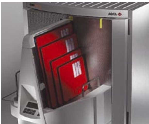
Integrated CR user station for time-saving identification and optimized workflow